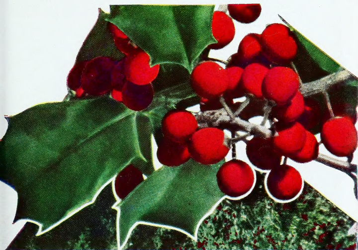
MISS HELEN. One of the best American Hollies.